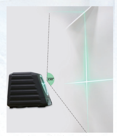
150° wide projection angle